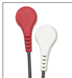
1 Channel Leads

Channels ..... 1 Number of Events ..... 4 Sample Rate ..... 256 Samples Per Second Total Recording Time ..... 8.5 Minutes (512sec) Transmission Speed ..... 1x / 3x